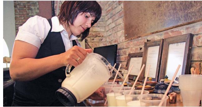
Latvian Dairy Museum

In the Latvian language, Saldus implies sweetness and there is no shortage of it in the town by that name. Vote for your favourite ice-cream flavour at Druvas saldējums; discover the delights of Latvia's milkier version of fudge, the gotiņa, at