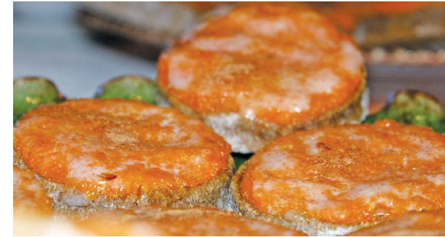
Žograis or sklandrausis

prides itself on maintaining traditional brewing traditions and the use of carefully selected malt, hops and yeasts, even water. Take a brewery tour and taste live, unpasteurised beer the way it should be.