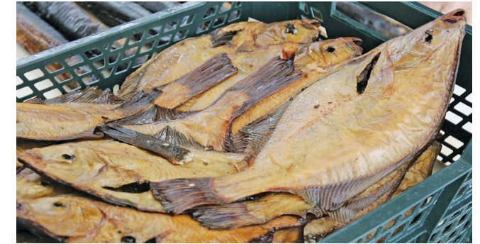
Ragaciems Fish Market

Along the east coast, enjoy a Banquet with Fishermen at the hotel in Roja . This is a full experience of a fisherman's life as you ride out into the sea in fishing boats and then enjoy a typical meal - fish soup cooked on the campfire, rye bread and smoked fish. Learn local folk songs, dances and games.