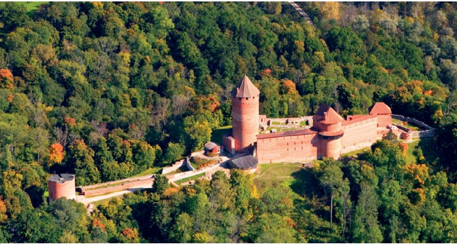
Turaida Museum Park

Easily reached from Riga, Sigulda sits at the south of the Gauja National park on the tall banks of the ancient Gauja valley. Surrounded by historic sites, the town itself features the Sigulda Medieval Castle ruins , originally built by the Sword Master of the Venn Order in 1207. The later, Livonian Order convent with its Gothic apertures and the main gate tower survive and provide a wonderful backdrop for summer's open-air concerts.