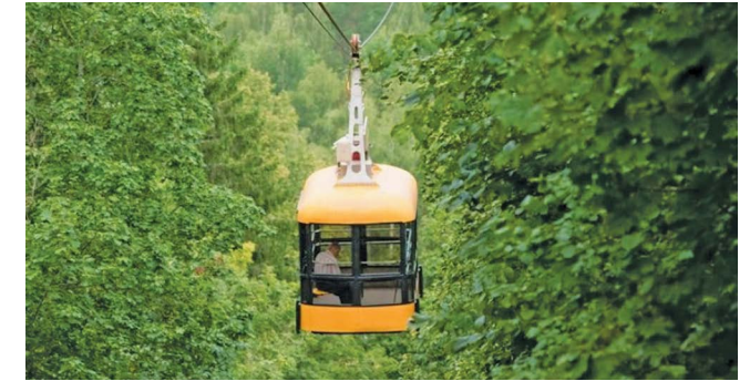
Cable car in Sigulda

Take a seat, relax and enjoy awesome views of the deep, ancient Gauja valley as you ride Sigulda's Ferris wheel and