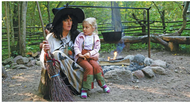
Tervete Nature Park

We start in Tervete Nature Park , site of an ancient Zemgalian fort, and famous for its tall 300-year-old pines, used to create the park's sculptures - fairy-tale characters of Anna Brigadere. Ramble the lush nature trails, row or fish in beautiful Swan Lake with its many birds, ride on the train.