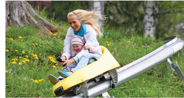
Sigulda Adventure Park

unyielding curves into the Gauja valley. There are many other activities, more or less strenuous (anyone for Zorbing or bungee-jumping?), but in winter downhill skiing takes over.