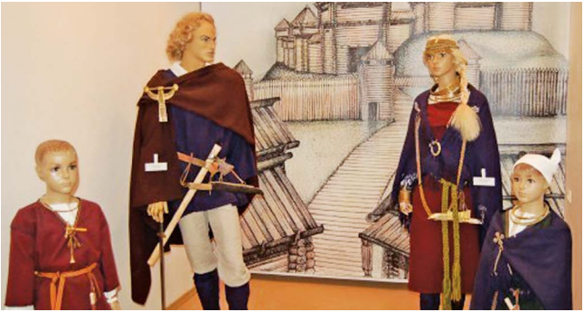
Dobele Local History Museum

The Great Ķemeri Heath or raised bog has been formed over 8 000 years by the action of Sphagnum or peat moss, creating layers of peat as much as 8m thick, but still living. All the rain and snow falling on the heath is collected in the bog which can hold up to 20-25 times its weight of water. Only a few shrubs and stunted trees can survive, hence the eerie landscape.