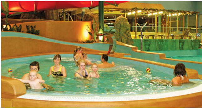
Water Amusement Park in Ventspils

favourite ice-cream flavour at Druvas saldējums (how about chicory?); discover the delights of Latvia's milkier version of fudge, the gotiņa, at Saldus pārtikas kombināts; watch tasty bread, cakes and pastry being made at Saldus maiznieks.