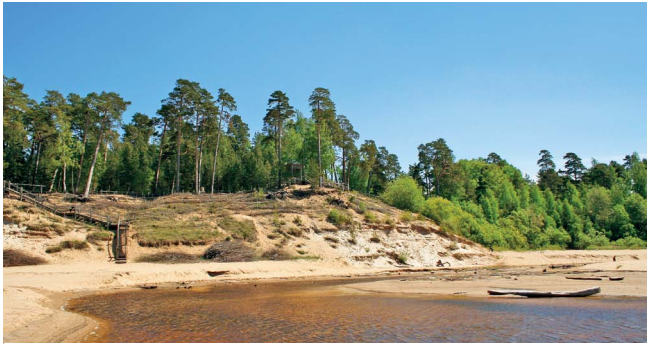
Sunset Trail in Saulkrasti

Just north-east of Riga, Vidzeme coast resort Saulkrasti is much more relaxed than Jūrmala. Perfect for just lying on the white sand beach or taking the 4km-long Sunset Trail from Baltā kāpa (white dune) through tall pines to the town itself. Climb the dune for stunning views up and down the coastline and of the Inčupe Pēterupe estuary.