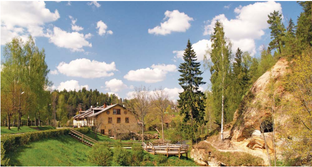
Līgatne paper mill village

Back up the top of the valley, the Turaida Museum Park hosts a valuable collection of historical artifacts. Explore the cultural heritage of the Gauja Livonians, climb the medieval stone castle tower, see the drawbridge, battlements, gates and guard towers, chapel and secret passage. Turaida Church is beautiful and elegant in its simplicity.