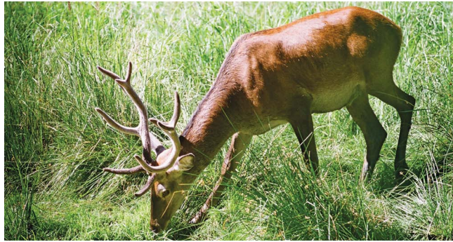
Līgatne Nature Trails

one of the most outstanding and most original 19th century landscape parks in Latvia.