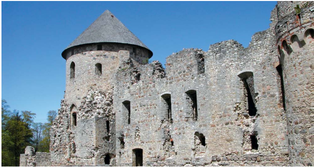
Cēsis Castle and Manor Complex

On the other shore of lake Āraiši, Geidānmuīža or Geidanmois is being created as a centre of medieval Livonian skills and historical re-enactments. Book time in Livonia, take up your sword or enjoy more peaceful activities.