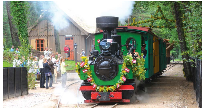
Seaside Park in Ventspils

The pearl of Kurzeme, Kuldīga is acknowledged to be one of Europe's foremost tourist destinations with its enchanting narrow streets and courtyards. The Alekšupīte river flows along the walls of Old Town houses. The redbrick Venta bridge exudes a special charm. The Pilsētas dārzs gardens are embellished with sculptures. With its rapid flow and extraordinary width of