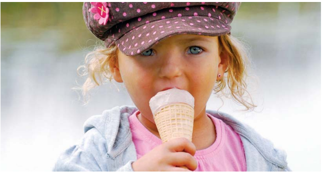
Rūjiena ice cream

Follow the gorgeous Salaca upstream to Mazsalaca where the Skaņākalna Nature Park stretches along 3km of the river