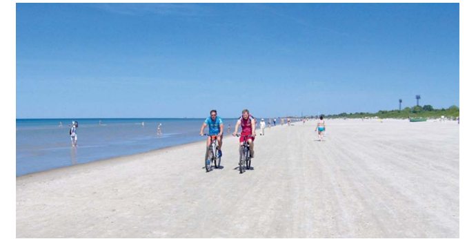
Liepāja Beach and cycling routes

The fact that the 2012 World Championship was held in Liepāja is clear proof that this is a serious windsurfing centre. Host club Rietumkrasts (West coast) caters for the serious windsurfer, but also has an eye for the future as it offers training and