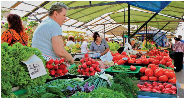
Riga's Central Market

Riga’s Central Market presents an imposing sight from the river as the curves of its three massive pavilions resonate with the arches of the railway bridge. An obligatory stop for tourists, it is no less imposing up close with its fascinating architecture, huge selection of fresh foods and typical market fare. Check out the Spīķeri area across the tram tracks for gourmet meals in trendy eateries.