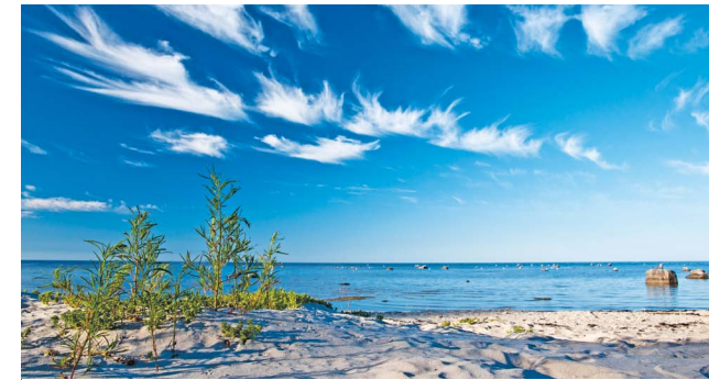
Beach at Kaltene

One of many attractions in the port of Ventspils , the Seaside Park nestles in copious greenery. Chug along one of two routes on the antique narrow gauge railway. Walk the Jungle trail and greet its resident animals, exquisitely carved from wood. Try out different surfaces: dolomite slabs, wood blocks and chips, bark or cones. Energetic visitors can climb and swing through the trees on the challenging obstacle course.