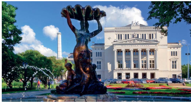
Latvian National Opera

Start your journey by absorbing 800 years of history as you wander through the narrow, cobbled streets of Vecrīga , Riga's medieval Old Town, with churches, museums and galleries catering to all tastes secreted among its diverse facades. Count the warehouses to grasp Riga's history as a great Hanseatic port.