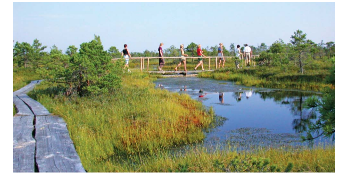
Great Ķemeri Heath

Strike inland to Valdemārpils and the Laumu Nature Park , jam-packed with the Bee, Bird, Plant and Forest educational trails for experiencing the wonders of nature. Active leisure seekers will enjoy the Sports trail with its obstacles testing agility and balance. Try out other recreational activities - mini golf, trampolining, fishing, cycling, even candle-making. In winter, cross-country skiing is the way to go.