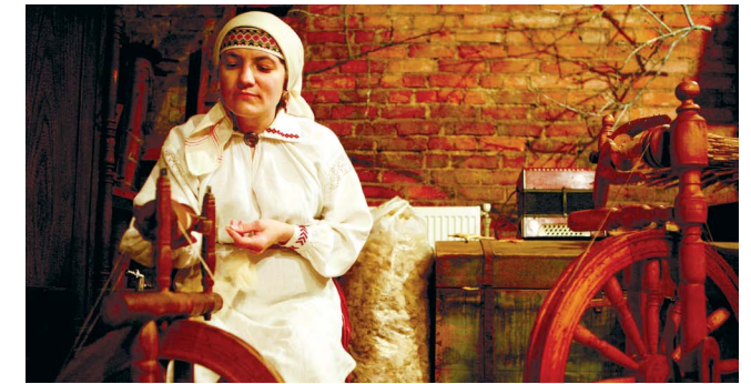
Ludza Craft Centre

Daugavpils Fortress is an impressive fortified edifice covering a total area of more than 150 hectares and is the only untouched, early 19th century fortress remaining in east Europe. The fortress's jagged contour consists of a bulwark with eight towers, ravelins and contrgades with other defensive structures - lunettes, redoubts and a moat. A scone on the left bank of the Daugava protects the bridge. Inside the walls,